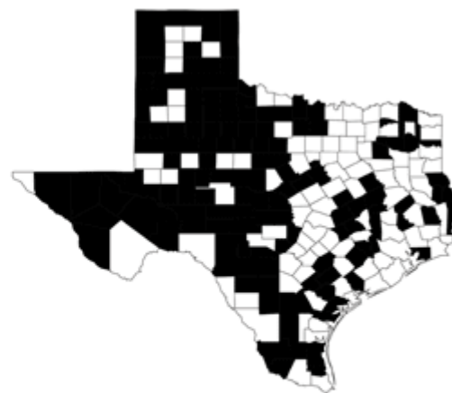
Texas counties without obstetricians four years after Proposition 12 passed.